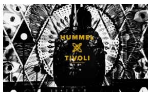
The Sneaker Update – Hummel X Tivoli