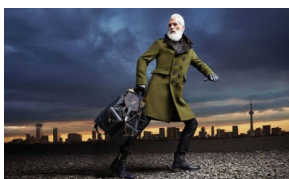
Merry Christmas to all our readers!